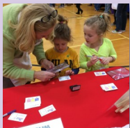
Fingerprint Discovery Students can discover how unique the human body can be, no two are alike!