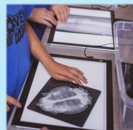
Imaging Experience the different ways we can view images of objects to learn more about them.