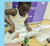
Cubelets If you've ever wanted to custom build a robot—this exhibit is for you!