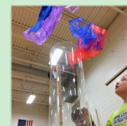
Wind & Air Energy Explore the power of air with our wind tunnel and blower boxes.