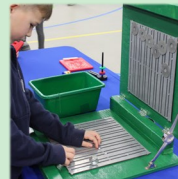
Magic Magnets Harness the power of magnets to create a masterpiece!