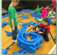
Imagination Playground Ramps, Thrones, Walls, Forts, Build it all!