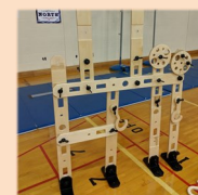
Riga-ma-jig Future engineers will love harnessing the power of simple machines.