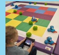
Dr. Dash Role Play as a Doctor performing Robot-Assisted Surgery.