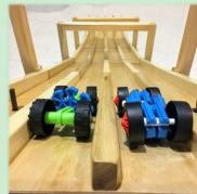
K'Nex Build & Race Build your own K'Nex car and race it on the ramp.