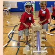
Discovery Ramps Kids can build simple or complex ramp systems using a variety of wooden parts.